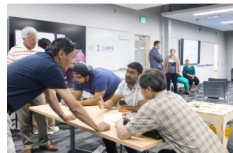
Mentor coaching at LEC

The ENGAGE Mentors are a group of experienced business leaders and entrepreneurs who volunteer their time, knowledge, and experience to help UWM innovators develop their ideas and start-ups into stronger companies. They provide useful feedback, advice, suggestions, and action items to keep moving forward.