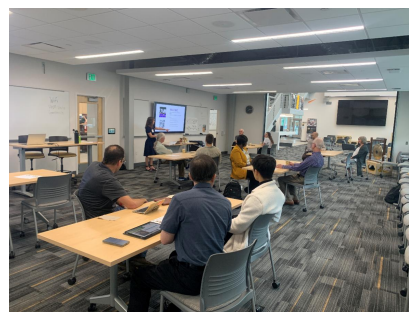
Mentees engage in conversations from experienced professionals at previous speed mentoring events.